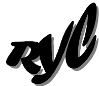
Redcliff Youth Centre